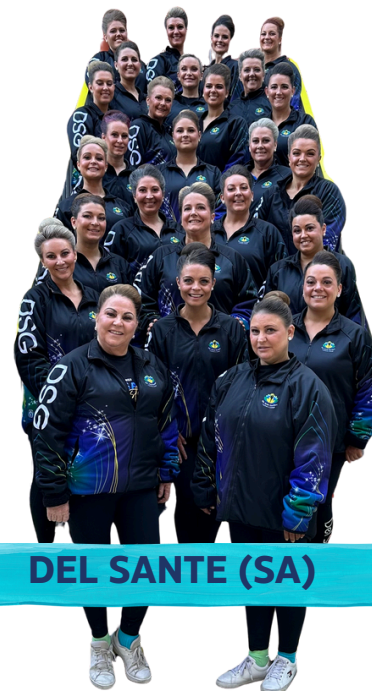
DEL SANTE (SA)