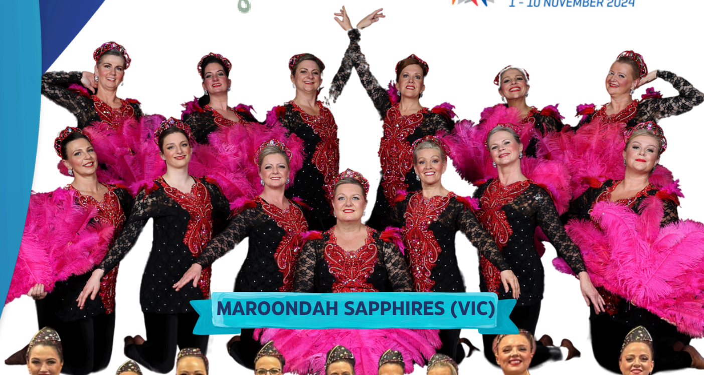
MAROONDAH SAPPHIRES (VIC)

PAN PACIFIC MASTERS GAMES GOLD COAST AUSTRALIA 1 - 10 NOVEMBER 2024