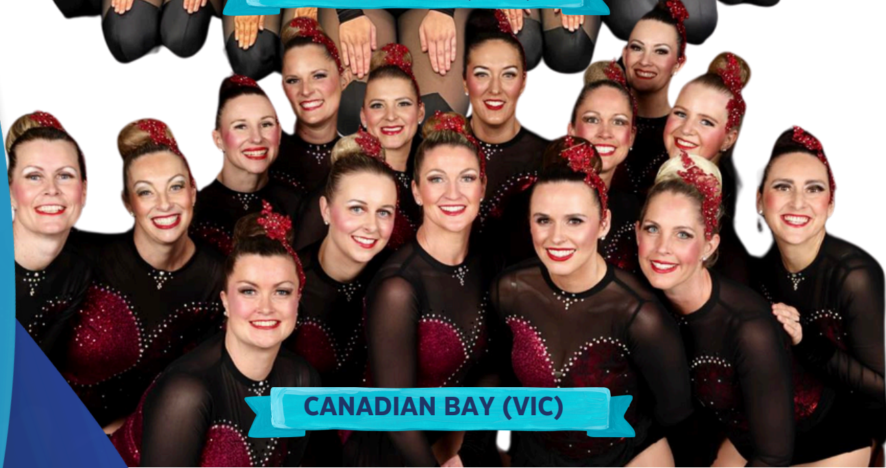
CANADIAN BAY (VIC)