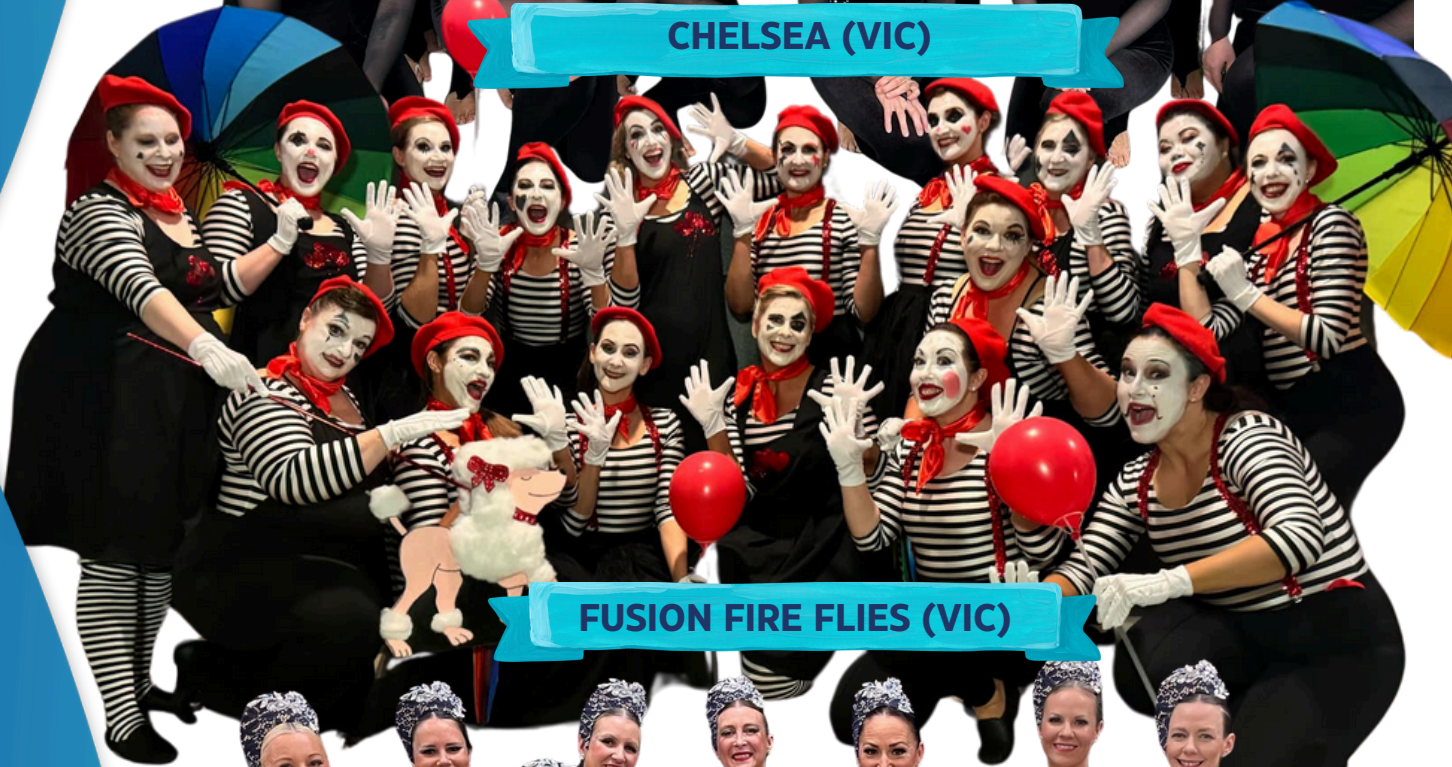
FUSION FIRE FLIES (VIC)