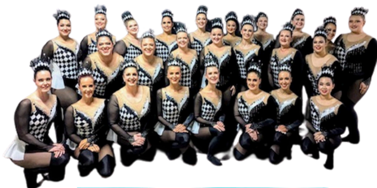
EMMANUEL EMERALDS (VIC)