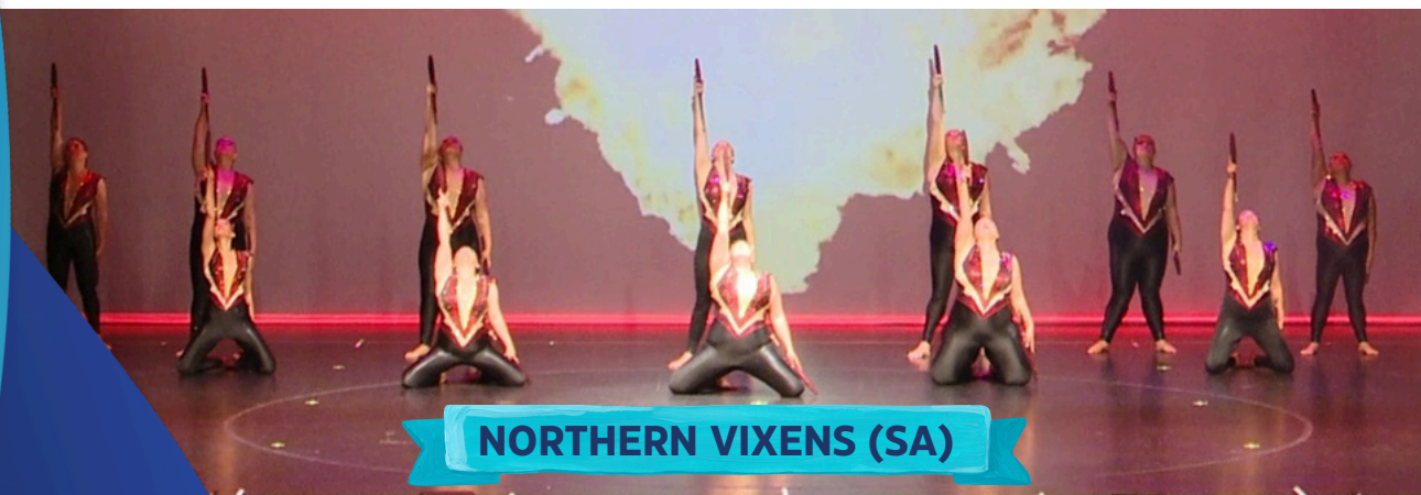
NORTHERN VIXENS (SA)