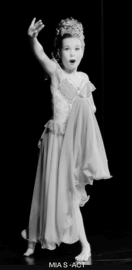
MIA S - ACT