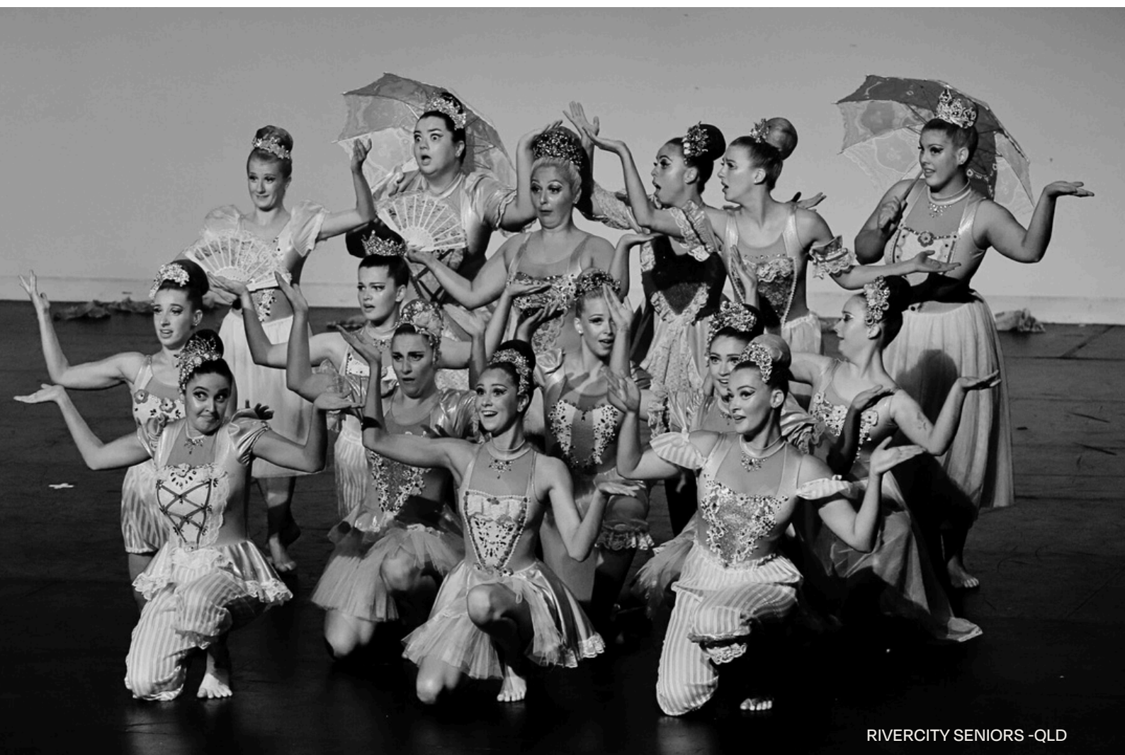
RIVERCITY SENIORS -QLD

The next phase of the ACF Nationals refresh project will focus on translating the evidence-based review findings into the development of the ACF National Competitions & Events Framework (NCEF). To ensure a structured and collaborative approach, ACF will establish a terms of reference for the NCEF working party, which will be representative of ACF membership, including Member State and Advisory Board representatives. This group will use the review insights to shape the framework's structure, ensuring it aligns with community needs. Once the initial structure is developed, further consultation with key stakeholders will refine and finalize the framework. The implementation timeline will support a strategic rollout from 2026 to 2028, ensuring a well-planned, inclusive, and sustainable approach to national competitions & events.